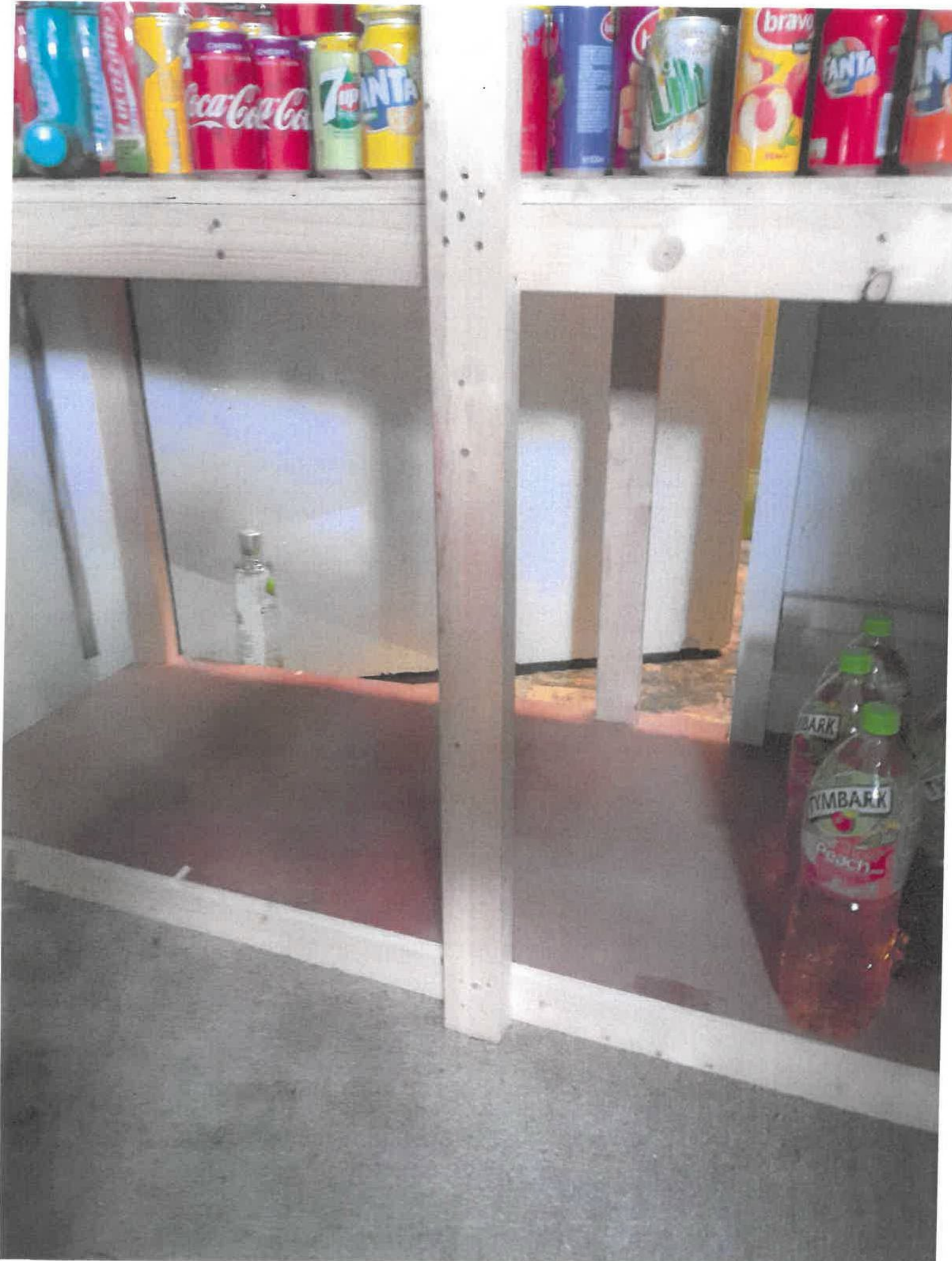
Ex. RW 1